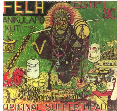
Fela Kuti and Egypt 80, Original Suffer Head, Lagos International Records, 1981, courtesy of El Anatsui and Efié Gallery