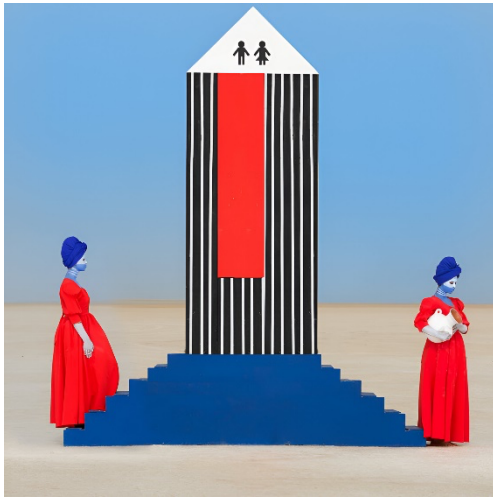
Aïda Muluneh, Steps (2018)