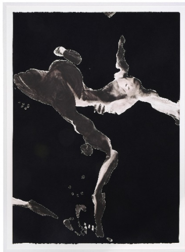
Kesewa Aboah, A Lightness 5 (2023)